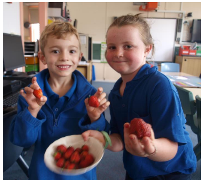
Strawberries from the garden